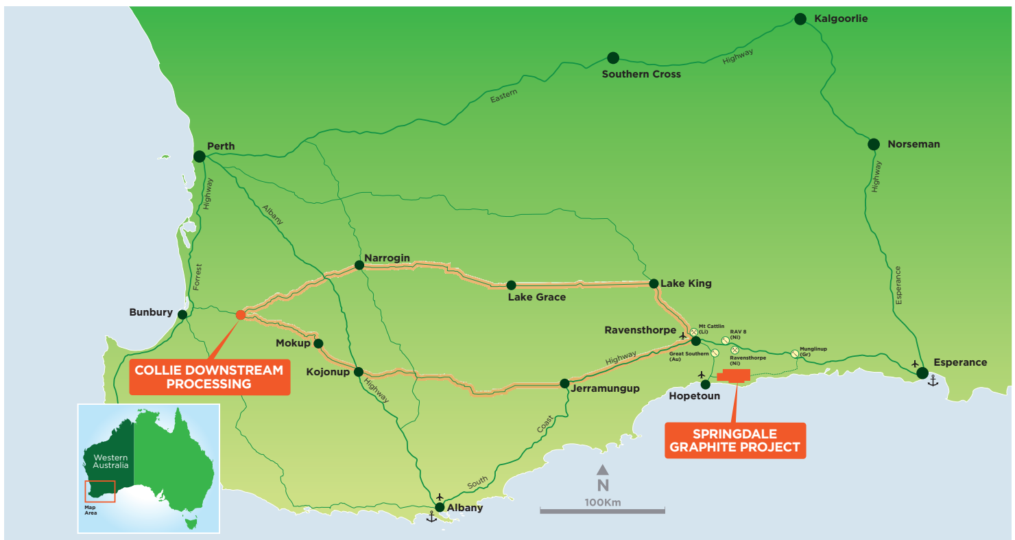
Figure 1: Location of International Graphite Projects.