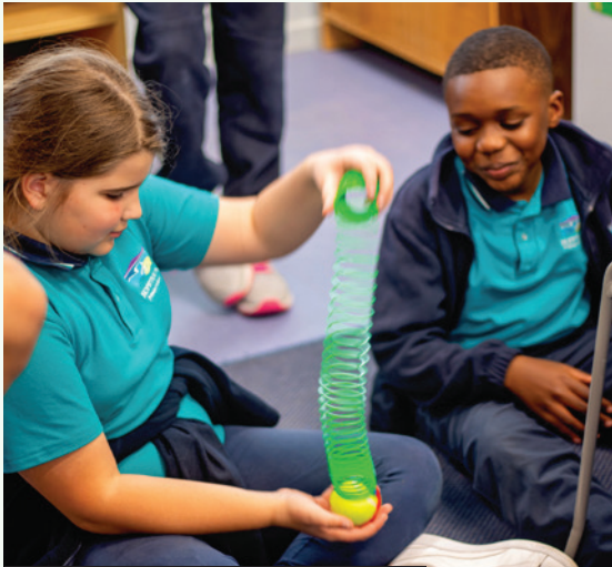
Figure 10: Hopetoun Primary School Students explore the Einstein-First program.

In response to the WA Government's inquiry into climate science education, the program now includes a strong focus on climate science and alternative energy futures for students in upper primary and middle school. The research team has been strengthened with key science educators from Curtin University, University of Southern Queensland, Australian National University, Flinders University, and the Education Faculty at UWA.