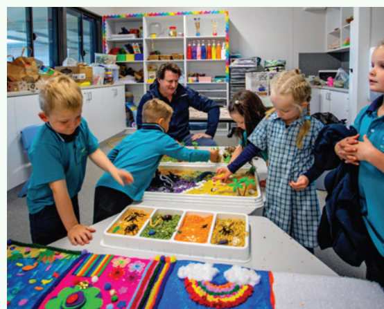
Figure 9: Students have fun with science as International Graphite brings the Einstein-First program to Hopetoun Primary School.

As well as bringing the program to schools in the Hopetoun-Ravensthorpe region, the Company has become an industry partner for ongoing research into science education and professional development for teachers.