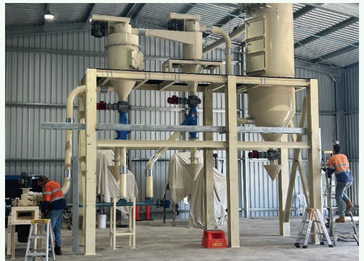
Figure 7: Qualification plant installation at International Graphite's R&D facility, in Collie, Western Australia.

The new equipment will also be used for testwork on graphite concentrates prepared from drill core from Springdale. This will assist in qualification of the Springdale graphite material. The plant can be further extended to shape micronised graphite into a spheroidised product.