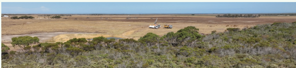
Figure 5: Drilling at Mason Bay.